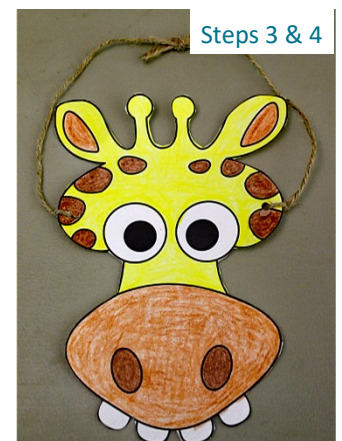
Steps 3 & 4

5. Show us your mask on our Facebook page "Adventures in EdZooCation" or tag the North Carolina Zoo at #NCZOO or #NCZOOED.