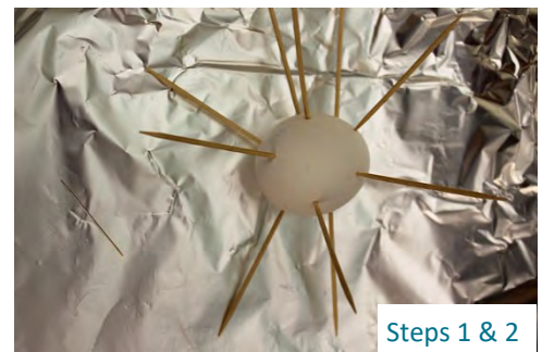
Steps 1 & 2

Take a whiff—how bad is the smell? Rate the stink a number between 1 and 10 with 10 being the worst.