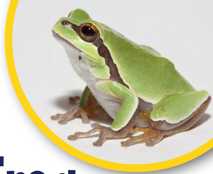
Pine Barrens Tree Frog

Since 2014, the NC Zoo and other partners have studied pine barrens tree frogs using radio telemetry. Tiny belts are placed on the frogs so they can be tracked over a period of time to see how they use their habitat.